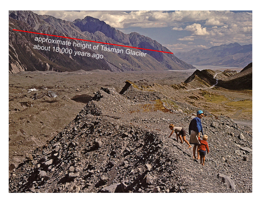
Figure 2. Photograph of the lower reaches of the Tasman Glacier (the ice is covered with rock rubble), taken in 1967 (the glacier has retreated further since). The red line indicates the approximate height of the glacier 18,000 years ago.

We are being told that many glaciers around the world are retreating and that this is caused by MMGW. Yes, most glaciers (and ice caps) have been melting, but they have been doing this for the last 18,000 years (since the so-called Last Glacial Maximum), resulting in a sea level rise of 120 metres(!). On Figure 2 I have indicated the level of the Tasman Glacier 18,000 years ago. But there have also been periods of cooling during the present Interglacial warm epoch, like during the Little Ice Age (1300 to 1850 AD), when glaciers advanced again. But many glaciers must have anticipated the coming MMGW, as they started to retreat already, well before greenhouse gases started to increase. For instance, the Franz Josef Glacier started to retreat in 1750 and the Himalayan Gangotry Glacier in 1780. I already mentioned the snow cap on Kilimanjaro. I therefore call these glaciers 'psychic.'